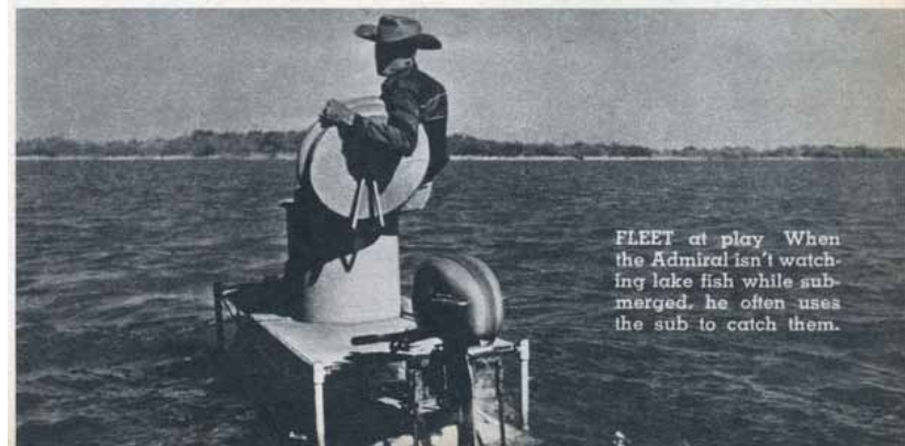
FLEET at play When the Admiral isn't watching lake fish while submerged, he often uses the sub to catch them.