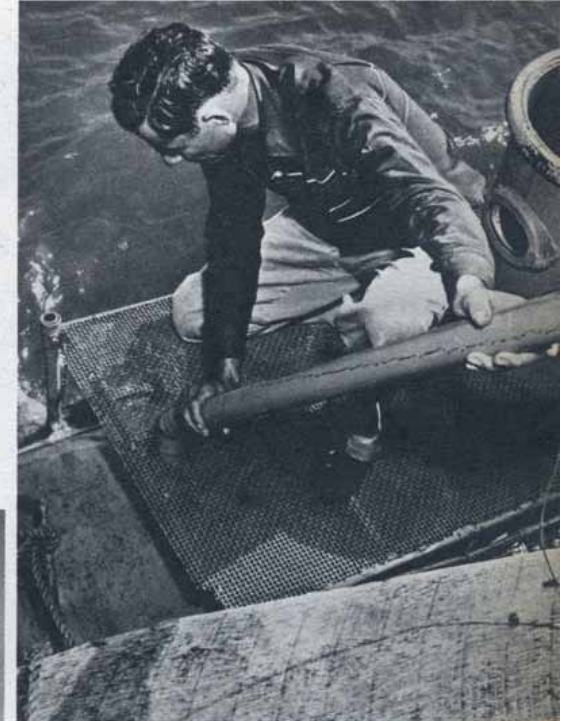
AIR is supplied by two snorkles when the Admiral wants to stay submerged. Water is kept from coming into sub in heavy seas by hollow copper float balls used in plumbing.